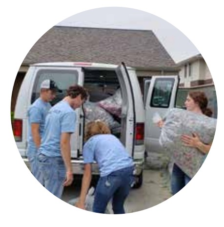
Southwest High School National Honor Society works on pop tabs

The AOI Gives program is designed to promote teamwork, leadership, employee engagement, community involvement and our identity as a company who cares. The RMHC program provided our 2019 team with a unique opportunity to interact with families directly and to find ways everyone within our organization could participate – no small feat considering the diversity of staff and services that make up our organization.