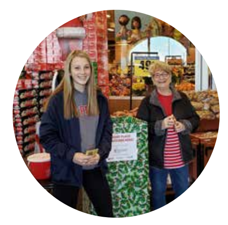
Stuff the Pantry is a great volunteer opportunity