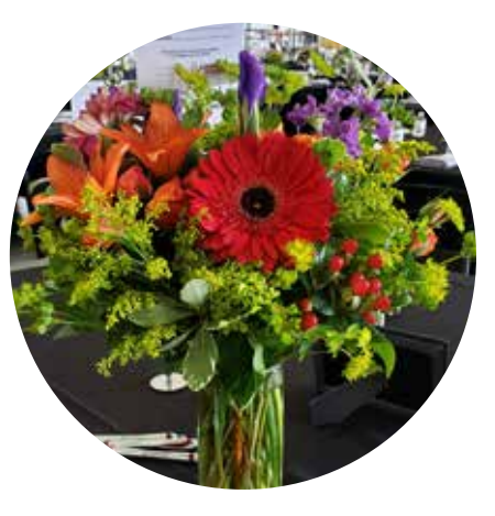
Beautiful floral arrangement provided by Family Fare

We do what we do for the House because we can, we care, we are in hospitality and we stand behind "Pure Hospitality"! What is "Pure Hospitality"? It's family, community, genuine, unscripted, honesty. Along with our staff, we believe RMHC fits into all of these categories.