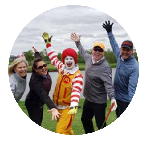
Premier Bank Team at RMHC Golf Tournament